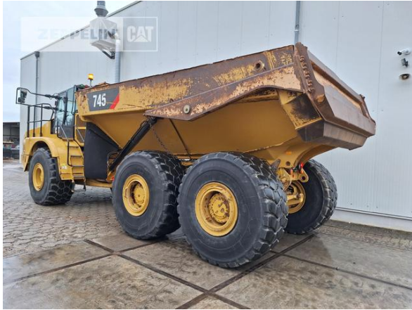
Cat 745-04 Serial No.: 3T601114