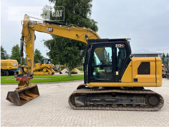
Cat 313GC Serial No.: NFZ10044